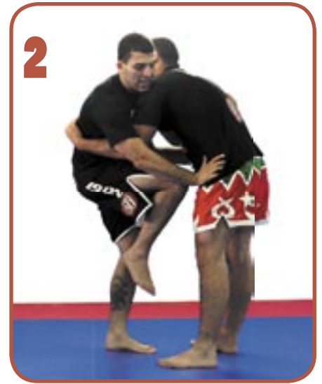
Enquanto Shogun cintura, Ninja empurra o quadril de Shogun para trás e acerta o estômago dele com o joelho direito.

While Shogun holds his opponent's waist, Ninja pushes Shogun's hip backwards and hits his opponent's stomach with his right knee.