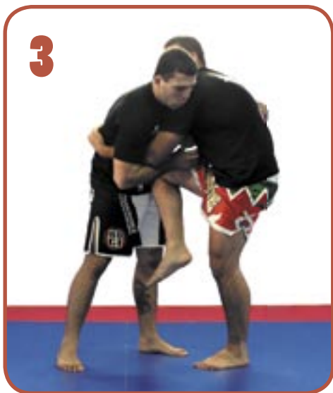
3 Em seguida, é a vez de Shogun acertar Ninja no estômago com o joelho direito. After that it's Shogun who knees Ninja on the stomach.